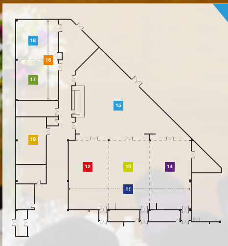
floor plan – orbiter conference centre

versatile and configurable meeting spaces to suit all requirements