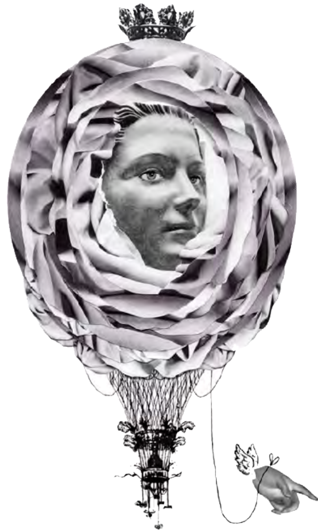
Le Royal Monceau - Raffles Paris 37, avenue Hoche - 75008 Paris