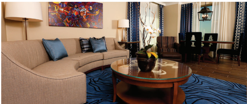
PREMIUM KING SUITE

Harrah's New Orleans is a magnificent, 26-story hotel in the heart of America's most alluring city. This AAA Four Diamond hotel sits right at the edge of the famous French Quarter and the Arts District, just steps from the riverfront and the Convention Center. But it's more than our prime location that makes Harrah's New Orleans the ideal spot for a meeting or event. In a city known for extraordinary dining and even more extraordinary entertainment, some of the best is right here at Harrah's. Add to that the versatile meeting spaces, unique venues and service that's as gracious as it is attentive, and it's plain to see why Harrah's makes hosting a successful, memorable event in the Big Easy even easier.